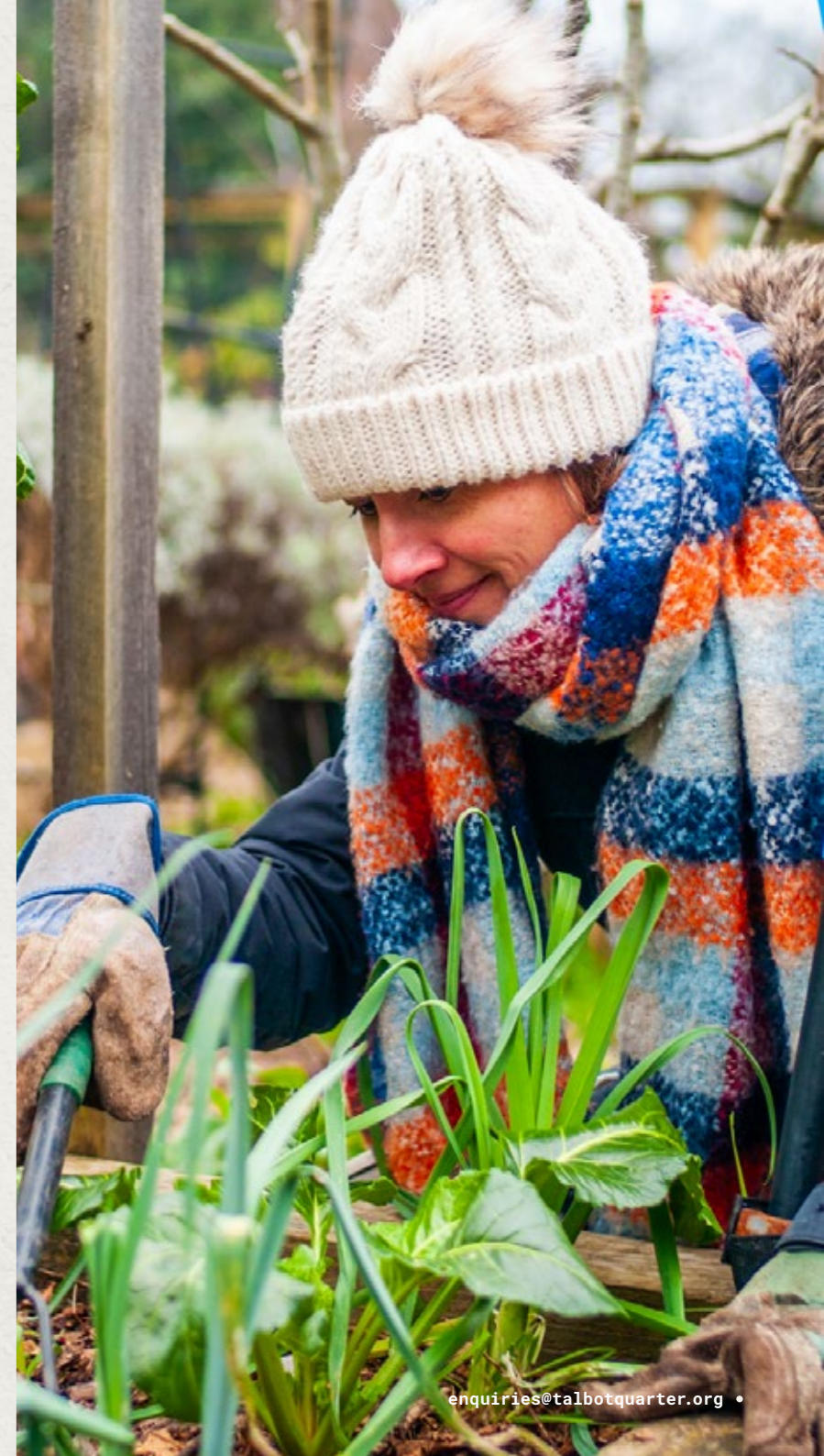
The Secret Garden at Grounded Community

It's a treasured place for all ages, where everyone is welcome.